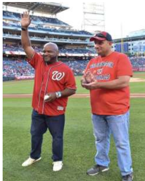
Golf and Bowling Labor Night at the Nats